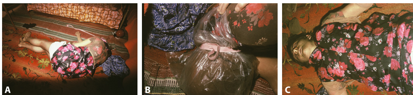
Fig. 2. The body scene of 18-year-old young man. A: Position of the deceased at the death scene. B: A plastic bag wrapped around the head of the deceased with a tape. C: The young man dressed in women's clothing.

A dead body was found lying on the ground on a carpet in a family house. Clothing suggested young, tall and slim-figured woman. A plastic bag wrapped around the head of the deceased with 2 cm wide pink duct tape made it impossible to do further identification (Figure 2A, B). Tape, identical to the material used to sew woman underwear, was wrapped around the neck three times and its loose end – 170 cm long – was laid out next to the body. Deceased was wearing tights, short blouse and a woman's two-piece suit. Another pair of tights were also put on both upper limbs (Figure 2C). After pulling off some layers of clothing, forensic pathologist present at the scene discovered that it was a body of a young man wearing four panties and three bras. Removing the plastic bag from the head showed five panties stretched over his head. Leg parts of the tights were wrapped around head and his half-open mouth