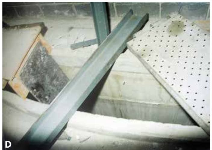
Figure 1. A, B, D: building where the accident took place. C: linear laceration involving the skin and subcutaneous tissues, 8 cm long, in the right frontal-zygomatic region.

was sufficiently wide to allow equipment to be transferred between the floors. Some wooden planks had also fallen together with the worker. No one heard the first worker crying out as he fell (Figure 1A, B, D).